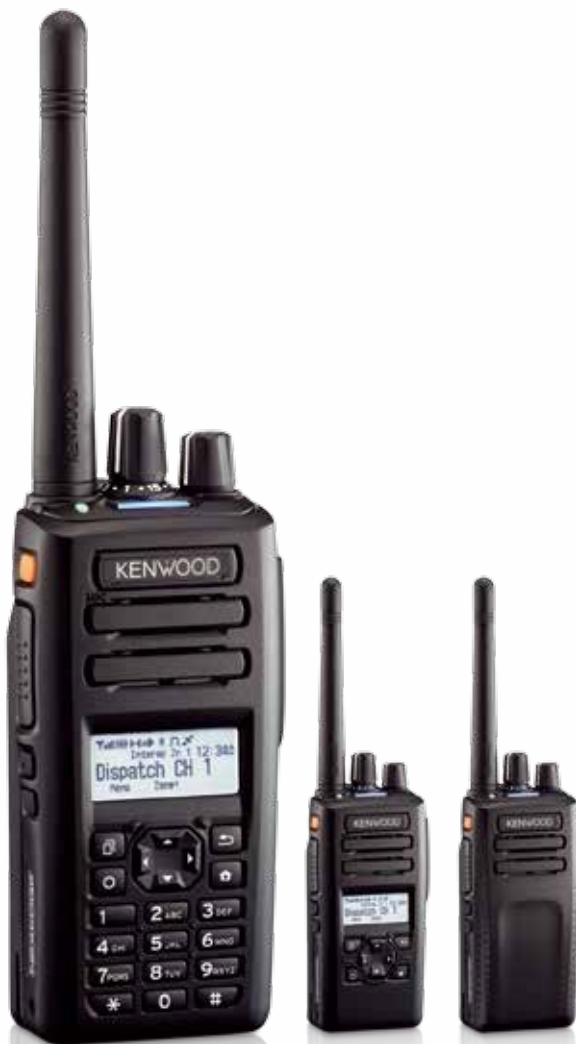
Full Keypad Model